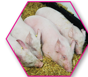
Infected pigs become weak and listless