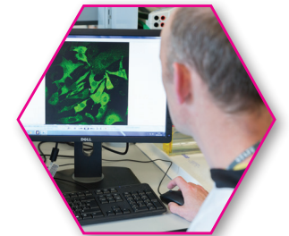
Our scientists study the virus to understand how it works